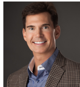
Paul Niccum Range, A Deluxe Company